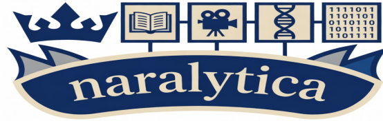
Logo Variation (uploaded)